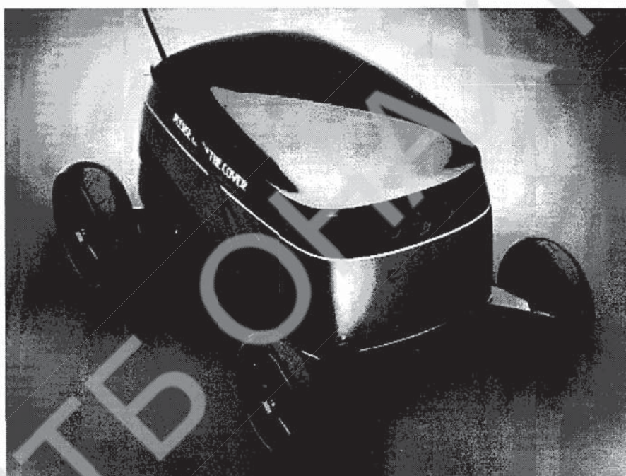
Fig. 1. The portable self-propelled robotic device on a wheelbase

After that we've chosen controller, motor control unit, sensors and power cell. Also we calculated electric elements for reduced voltage. They are used for sensors and other devices.