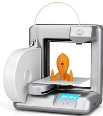
Fig. 2. 3-D Cubify Cube Printer

For printing, all the same popular PLA and ABS plastic are used, which are environmentally friendly materials. The color palette of these plastics is quite rich, has up to 26 shades, so each user will find exactly what he needs. The Cube cooking chamber can handle objects up to 140 x 140 x 140 mm.