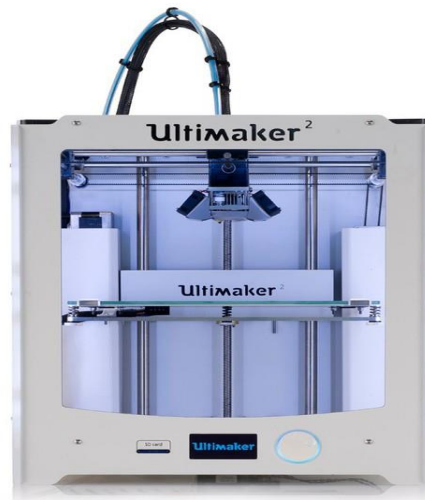
Fig. 3. 3D Printer Ultimaker 2

The device is equipped with an LCD display and a slot for an SD memory card, which allows you to work offline. Printing is carried out by deposition. The device is characterized by low noise, not more than 49dB - an excellent indicator for domestic or office use.