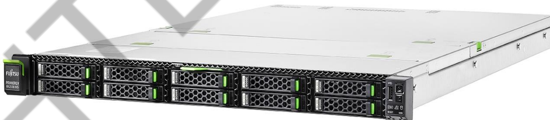
Picture 3.1- Server Fujitsu Primergy rx2530 m5

So, taking into account all these factors, as well as the software requirements, and the availability of a separate room for the server room at the enterprise, a 1U server of the Fujitsu company was chosen, namely: Primergy rx2530 m5 in the amount of two pieces to build a fault-tolerant cluster.