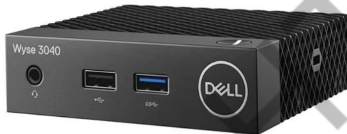
Picture. 3.3 - Thin client Dell Wyse 3040

Workstations. Since the ITS will be built on a client-server architecture, "Thin clients" will be used as workstations. After analyzing the "Thin Client" market, one of the leaders of this market was chosen, it is the Dell Wyse 3040. The Dell Wyse 3040 thin client is an effective solution made in a compact case.