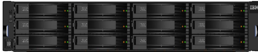
Picture. 3.2 - IBM FlashSystem 5010

Workstations. Since the ITS will be built on a client-server architecture, "Thin clients" will be used as workstations. After analyzing the "Thin Client" market, one of the leaders of this market was chosen, it is the Dell Wyse 3040. The Dell Wyse 3040 thin client is an effective solution made in a compact case.