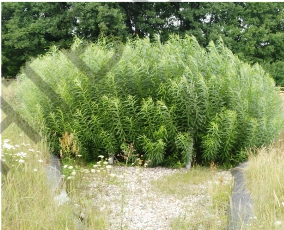
Fig.3. Hybrid constructed wetland

So far there has been built a lot of constructed wetlands in Poland. Many researchers test different equipment and combinations of plant species in order to obtain the best efficiency of domestic wastewater treatment. One of such scientific groups which concentrate on CW systems is the Department of Environmental Engineering and Geodesy from the University of Life Sciences in Lublin. The scientists design and make studies especially on the objects located in south-eastern part of Poland, in Lublin voivodeship. The most common ones are recently the hybrid CWs located in the Roztocze National Park and in the Polesie National Park.