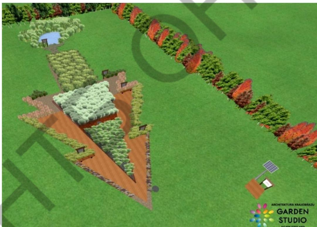
Fig.4. Hybrid constructed wetland in Kosobudy in the Roztocze National Park (VF-HF-HF)

It has been observed by many researchers that constructed wetland enable not only high efficiency of wastewater treatment but also a reliable operation for many years. According to many authors CW systems can be a great solution for domestic wastewater treatment as they enable the elimination of many different pollutants such as: TSS, BOD 5 , COD, total nitrogen, total phosphorus, heavy metals and pathogens.