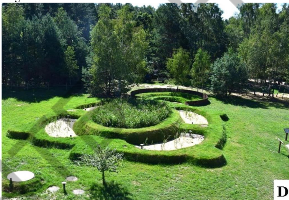
Fig.1. Hybrid constructed wetland in Stare Załucze in the Polesie National Park (VF-HF)

then called "wetland" and "constructed wetland" respectively. Such wastewater treatment is widely applied in many countries (Austria, Czech Republic, Denmark, Germany, Italy, Poland, Portugal, Korea, Japan, Australia etc.) Pollution removal in constructed wetland systems occurs due to the functioning of a biofilm which is formed during the flow of wastewater through the bed. Plants play an auxiliary role in the sewage treatment process. In the rhizosphere (around plant roots) oxygen is produced, while other parts of the bed are anaerobic zone and they are poorly oxygenated. Plants in the constructed wetland systems can be assessed as elements which enable constant oxygen supply from the atmosphere to the bed. Due to the aerenchyma diffusion of oxygen from the atmosphere through the leaves and reed stems allows oxygen to flow into the root zone and then into the ground bed ecosystem, where oxygen can be additionally transferred through molecular diffusion resulting from the chaotic movement of gas particles [Brix 1993]. Plants in constructed wetland systems can have the following functions: stabilizing the surface of beds and protecting them from erosive wind, excellent habitat for fauna (especially birds), excellent thermal insulation, protecting the filter material from freezing in winter, excellent conditions for the development of heterotrophic microorganisms responsible for the organic matter rotting.