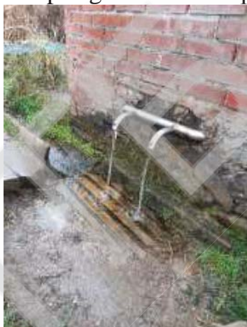
Figure 1. - Zhukovsky spring

To study the quality of drinking spring water, samples were taken at different seasons (summer and fall 2019) from groundwater springs located in Moscovsky (Hlibokiy Yar spring), Shevchenkivsky (spring Sarzhin Yar) and Kholodnogorsky (spring in “Yunost” park) districts, as well as on the territory of Zhukovsky village (Zhukovsky spring) within Kharkiv. Water from these springs is used by the townspeople for drinking and domestic purposes. Determination of spring water quality indices was performed on the basis of the Research Laboratory of Analytical Ecological Researches of the V. N. Karazin Kharkiv National University. Zhukovsky spring and spring in “Yunost” park are shown on the figures 1 and 2.