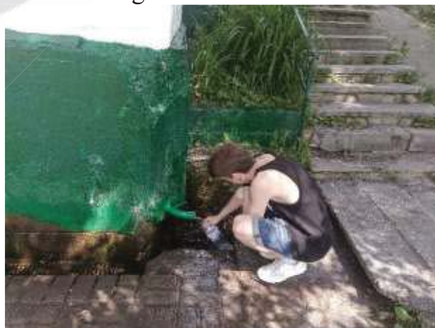
Figure 2. - Spring in “Yunost” park

Analyzes of drinking water samples from city springs were performed according to the following indicators: pH value, electrical potential, nitrate content, chloride, ammonia, nitrite content, transparency, turbidity, water hardness [1].