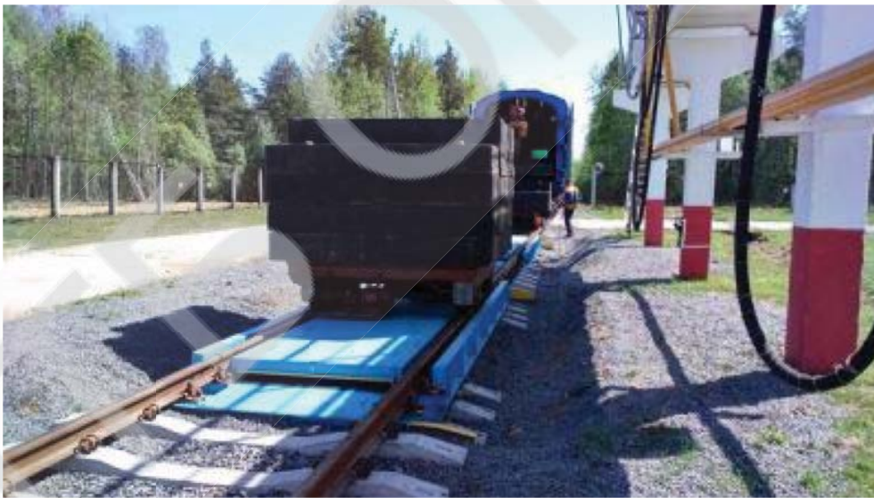
Fig. 3. Calibration of scales of a weight-measuring wagon

Figures 3-4 shows the general view of the installed scales.