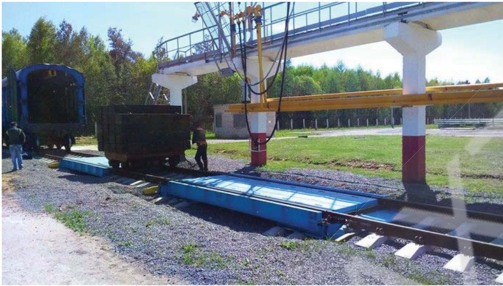
Fig. 4. General view of the installed railway scales